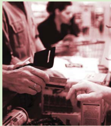
Banking & Finance